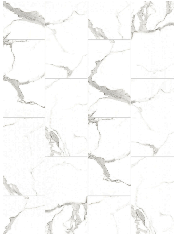
4 Colors Pg3